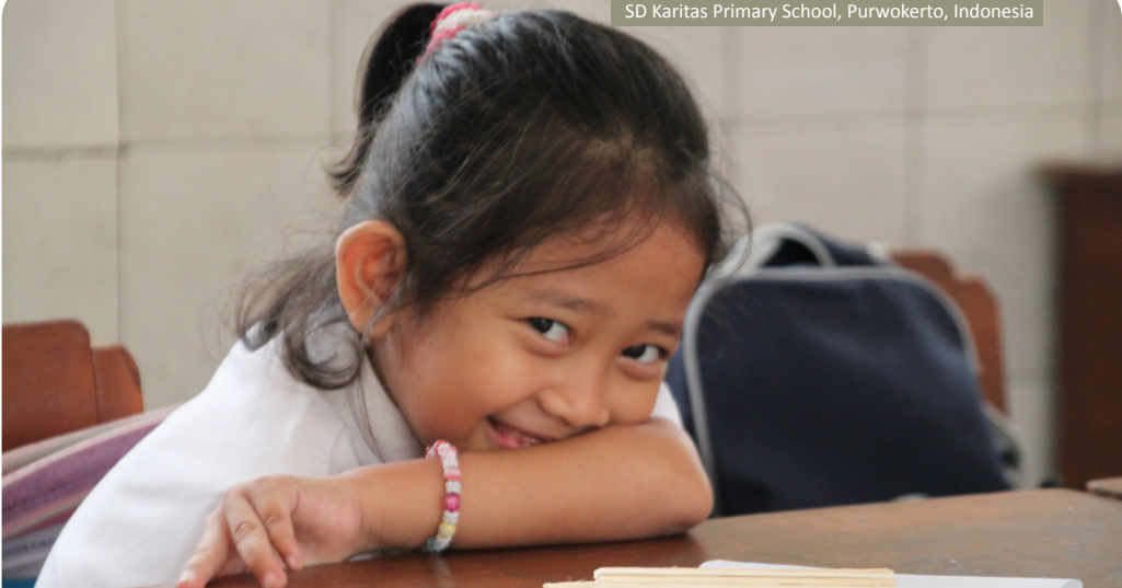
SD Karitas Primary School, Purwokerto, Indonesia

The NGO fully promotes the application of the UN resolutions regarding human rights without any form of discrimination such as that on the basis of functional impairment,