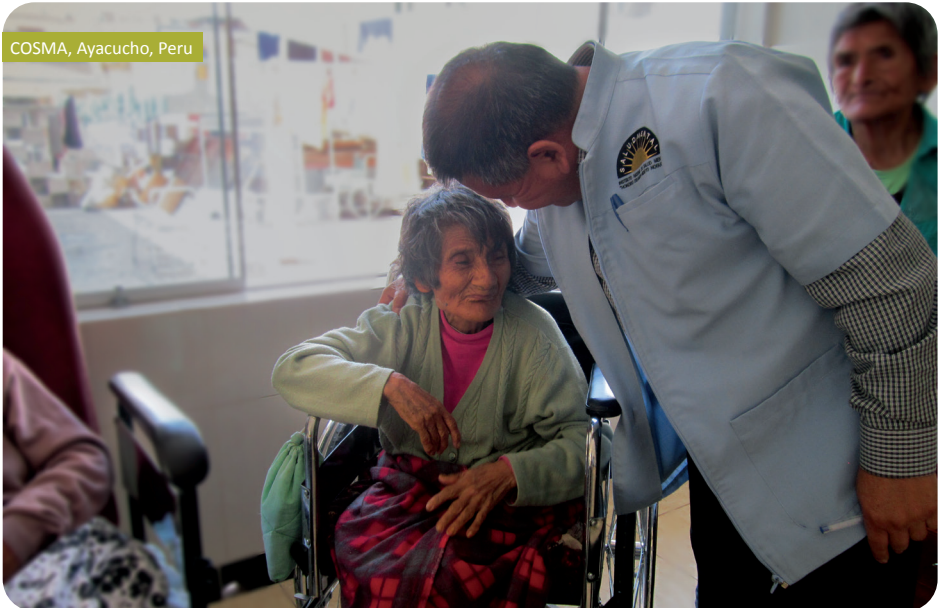
COSMA, Ayacucho, Peru

Fracarita International has a special consultative status in the Economic and Social Council (ECOSOC) of the United Nations. The NGO of the Brothers of Charity fully supports the United Nations Sustainable Development Goals (SDGs).